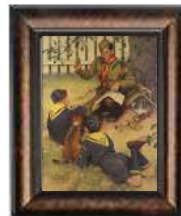
"The Adventure Trail"