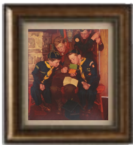
"The Right Way"