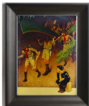
"Men of Tomorrow"