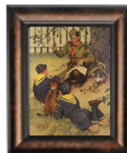
"The Adventure Trail"