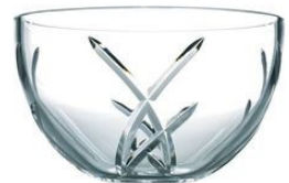
Second Century Society etched Waterford Bowl