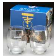
Second Century Society Juice Glass Set