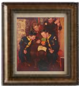
"The Right Way"