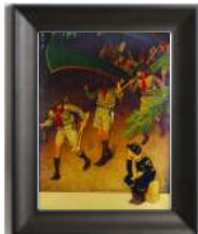
"Men of Tomorrow"