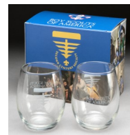
Second Century Society Juice Glass Set